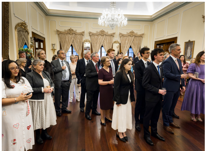
Mildura Senior College | Page 9