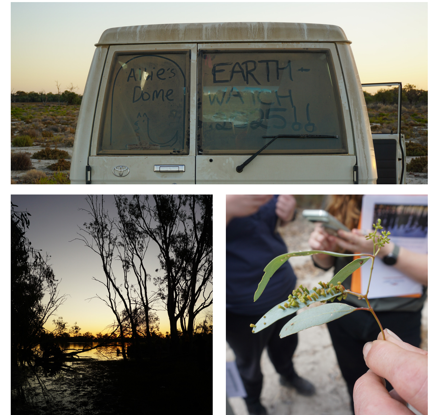
Mildura Senior College | Page 11