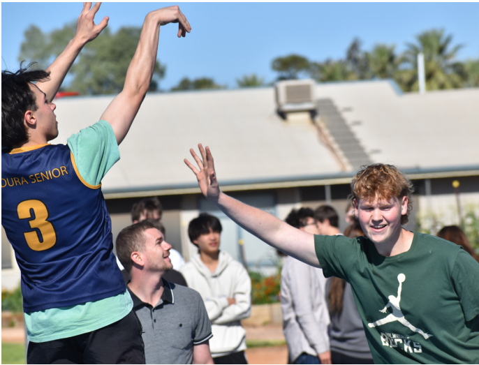
Mildura Senior College | Page 10